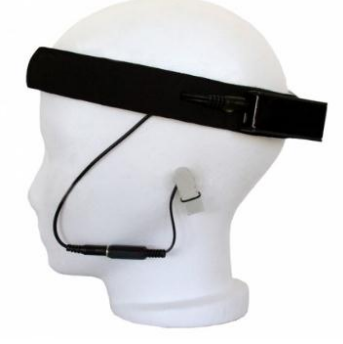
Figure 1. MindCap XL and ThinkGear module.

Registration of potentials of the prefrontal cortex was realized through unipolar output with two electrodes at the International 10-20 system of electrodes placement refer to frontal-polar: Fp1-Fp2 and hardware-assisted of single channel wireless system «NeuroSky ThinkGear» manufactured in the USA. This system includes scalp ring «MindCap XL» manufactured in Germany accustomed for application in neuro-biomanaging in sport and other researches (Figure 1). These sensors are a significant technological breakthrough in that they are the non-contact EEG sensors [19,20]. In addition, on the forehead signals of EEG from brain signals the and of EOG (electrooculography) from eye blinks and front muscles may detected too. Furthermore, several studies in the last years demonstrated significant results to use NeuroSky devise in various researches [21-24]. Thus, NeuroSky ThinkGear consists of proprietary firmware within a single channel [25,26], dry electrodes device. Herewith amplified 8000x to enhance the faint EEG signals and a standard fast Fourier transform (FFT) is performed on the filtered signal, and in fine, the signal is doublecheck for noise and artefacts in the frequency again using NeuroSky's owner domain, algorithms.